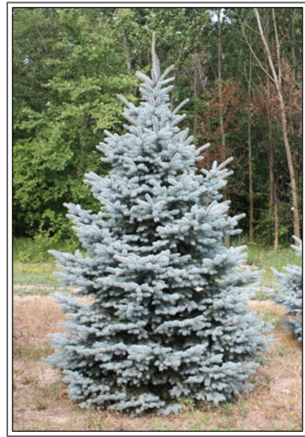
COLORADO SPRUCE 'Baby Blue'