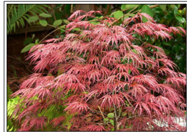
Japanese Maple -Laceleaf