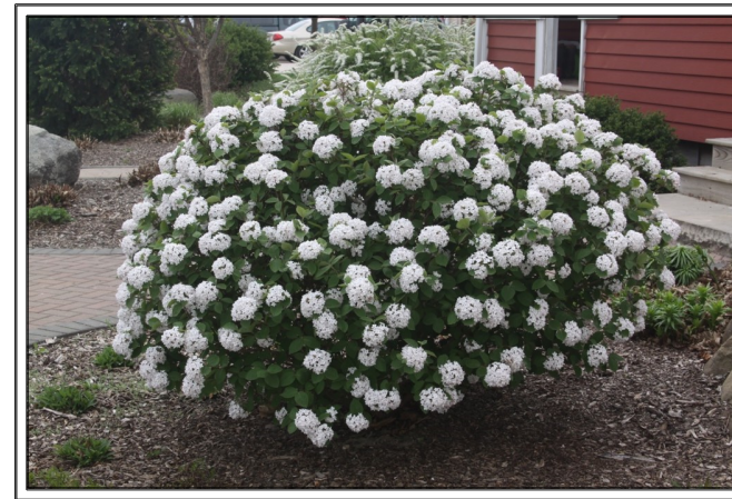
Viburnum 'Carlesii Korean Spice'