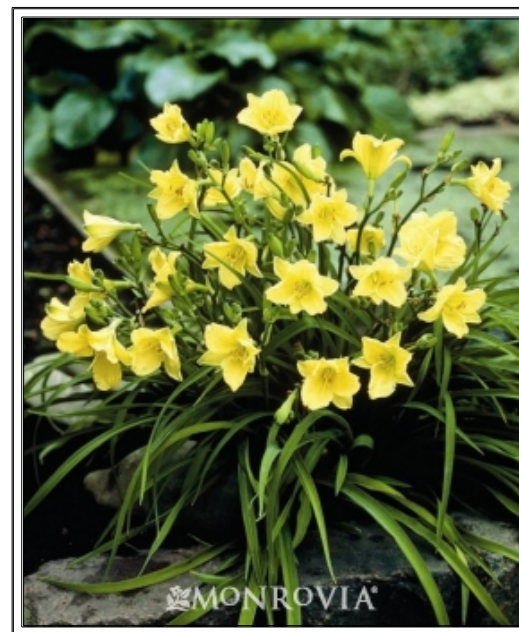
DAYLILLY 'Happy Returns'