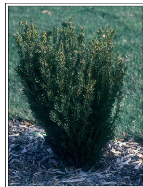
Taxus Hicksi Yew

REMOVE existing sod around trees and INSTALL plant mix, Mulch and Natural Spade edge.