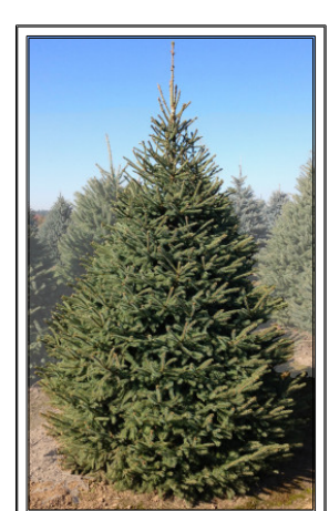
Picea-glauca-Densata- Black Hills spruce