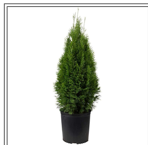
ARBORVITAE 'Emerald Green'