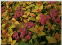
MAG CARPET SPIREA