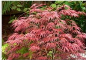
Japanese Maple -Lacini